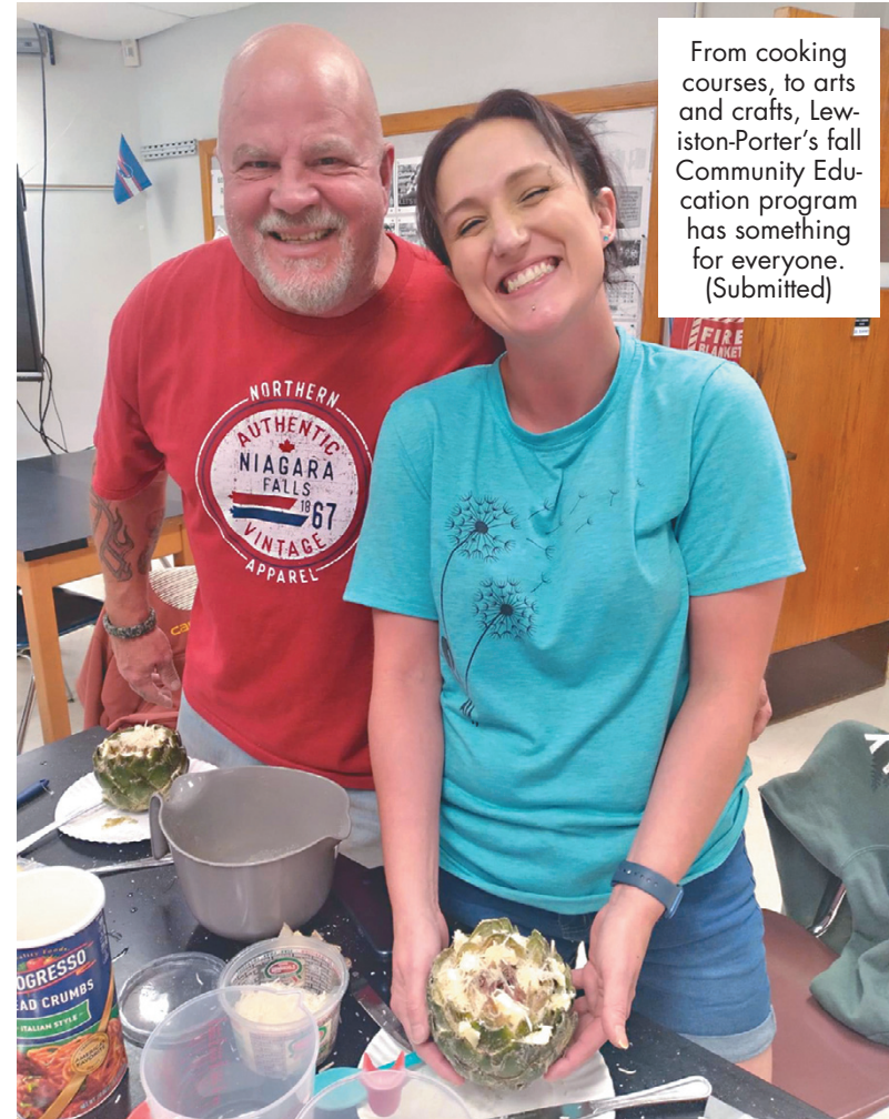
From cooking courses, to arts and crafts, Lewiston-Porter's fall Community Education program has something for everyone.

Lew-Port also added an in-person notary public preparation course and "Disaster Preparedness 101."